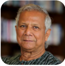
Prof. Muhammad Yunus

Nobel Peace Laureate Founder & Former Managing Director, Grameen Bank